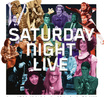
Annual Trivia Night & Auction | Saturday April 5, 20

Live from Overland Park, it's Saturday Night! Ready to bring the laughs and test your trivia skills? Register now for our Trivia Night and Auction! Whether you gather your own cast of characters and register as a team or sign up solo and join forces with fellow fans, this is your chance to shine under the spotlight. Assemble your Spartan Cheerleaders, Coneheads, or Weekend Update anchors and compete for the ultimate bragging rights—all while supporting our school. Don't wait—spaces are limited, and you won't want to miss this night of comedy, camaraderie, and fundraising!